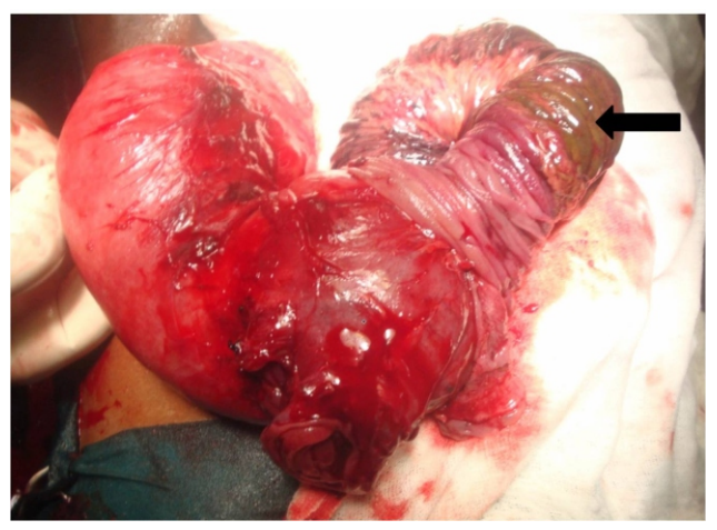
Figure 2: Intra-operative image showing the distal jejunum "telescoping" into the proximal limb across the Braun's jejuno-jejunal anastomosis.