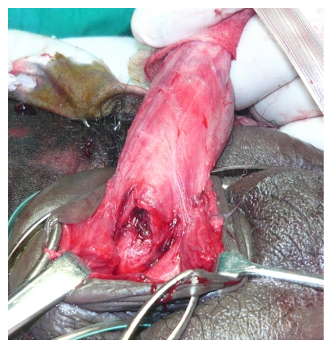
Figure 2. The defect in the corpus cavernosum

penis [1]. The usual causes of an acute penis are penile fracture or rupture of a dorsal vein of penis. Fracture is the commoner cause. Its incidence varies in different communities due to cultural differences. Certain cultures are associated with various manouveres related to the erect penis which can predispose to fracture.