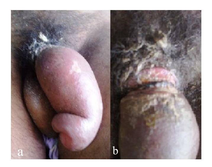
Figure 2a,2b. 2a-Case 2 with penile incarceration secondary to a constricting tight metal wire with gross edema of penile shaft. 2b-Metallic wire at the root of penis

hot mop over the penis, to lessen the oedema for 30 minutes, with intermittent cessation. Later the metal bolt was pushed distally and removed with the aid of xylocaine jelly lubrication. He passed urine soon after. His skin ulceration healed without further urethral complications.