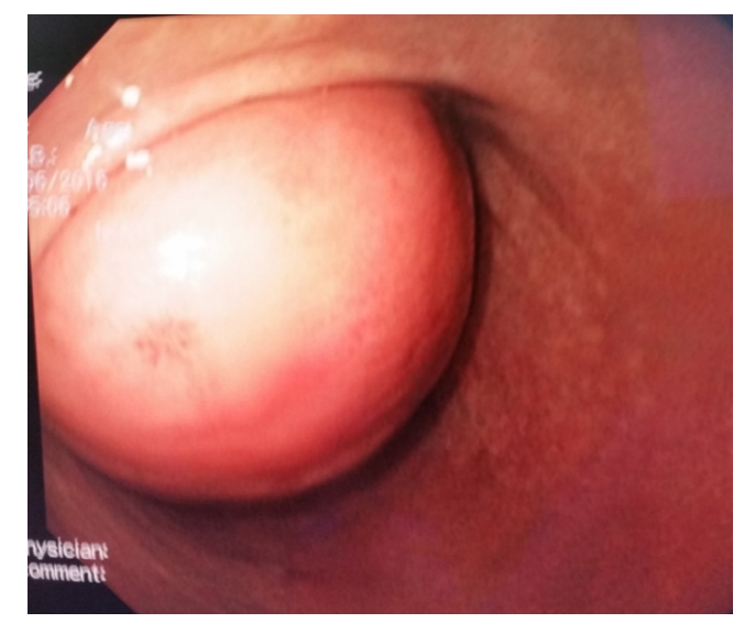
Figure 1. Endoscopic photograph showing the lipoma at the lesser curvature of the antral region

Correspondence: Sittampalam Rajendra E-mail: dr.s.rajendra@gmail.com Received: 10-05-2017 Accepted: 20-10-2017 b http://orcid.org/0000-0002-3303-603X DOI: http://doi.org/10.4038/sljs.v35i3.8418