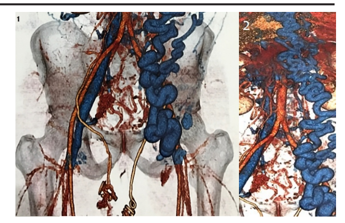
Figure 1 . Magnetic Resonance Angiogram of the recipient Figure 2 . Extensive collateral formation around occluded iliac veins and vena cava

patent portal-mesenteric system was considered as a potential alternative. Detailed counselling was done for both the donor and recipient regarding the possible outcomes and long-term benefits of transplantation versus haemodialysis.