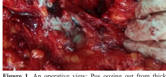
Figure 1. An operative view: Pus oozing out from thick walled shrunken gall bladder wall

obstructing shadow in its wall most likely a stone. Pancreatic parenchyma and the pancreatic duct were also normal. ERCP demonstrated normal CBD with no intraluminal pathology. An open cholecystectomy with CBD exploration was planned. Per-operatively, dense adhesions between the gall bladder and omentum were encountered. Meticulous dissection through adhesions explored a thickened, edematous gall bladder that oozing out the cheesy material and pus from its indurated areas while attempting to grasp the gall bladder with help of grasper (Figure 1).